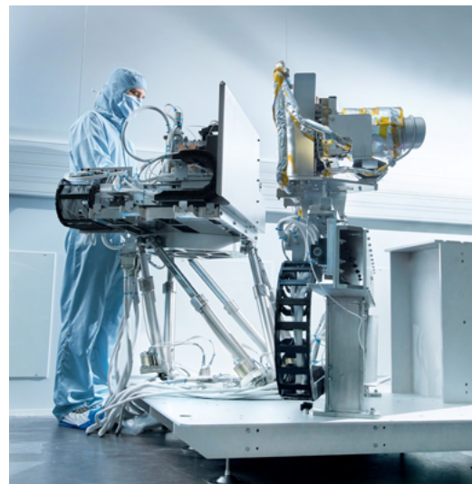
ISO5 clean room compatible hexapod to test space optical instruments for MTG (Meteosat Third Generation) satellites at BERTIN Technologies.