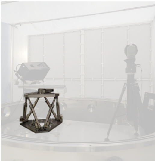
A vacuum compatible ZONDA hexapod is used at CSL to calibrate space optical instruments.